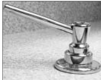
Liquid Soap Dispenser

The liquid soap/lotion dispenser can be used with any type of liquid soap or lotion. The liner of the bottle will not corrode or discolor the contents of the dispenser. To clean, use a soft cloth and blot dry. Do not use harsh abrasive cleanser or polishes, this can damage the finish on the dispenser.