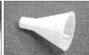
Funnel for re-filling the dispenser.

Additionally as a result of a transcription error on page 301, the note should read as follows: